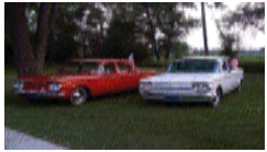
Aloha Unkl Larr

Hey! I'm still a certified "Corvair Nut" and as always Thanks for your support! See you on the road... seeing the USA in our classic Chevrolet Corvairs!!