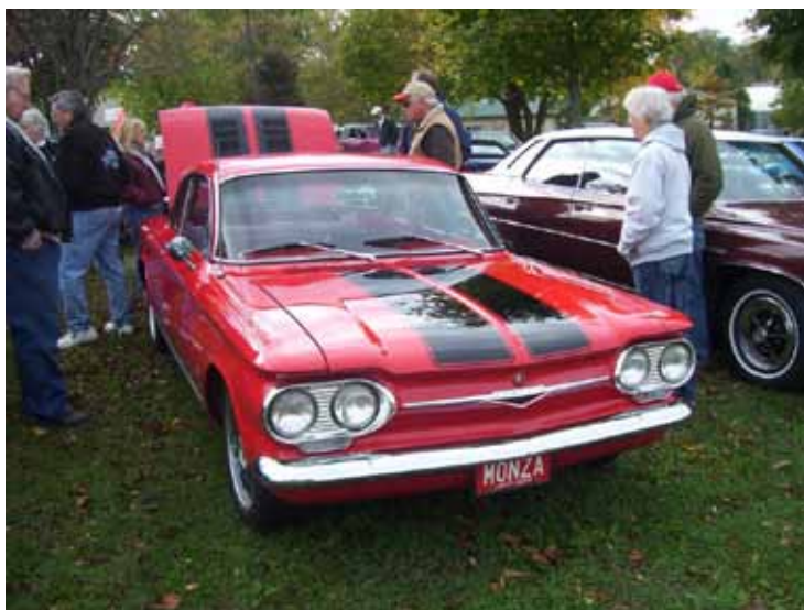
Murray Bruskin's new '61 Coupe