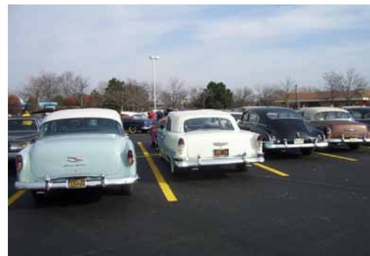
Vintage Chevys on hand for Chevy's 100th birthday.