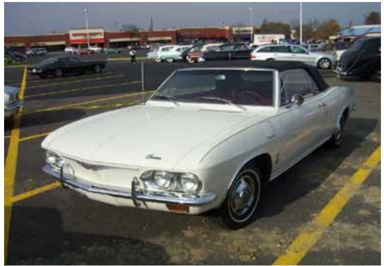
A '65 convertible Corvair made the run as well.