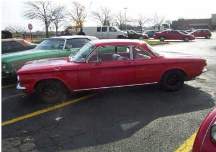
New wheels on Murray's '61 looked good